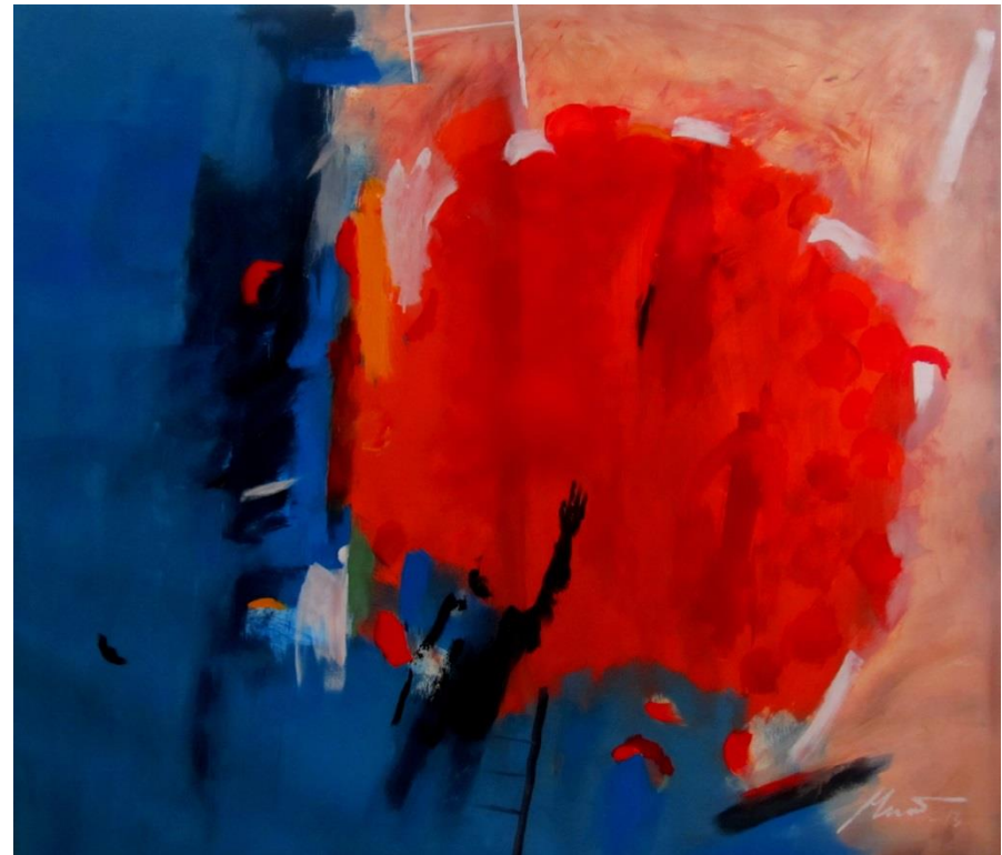
Tree full of apples